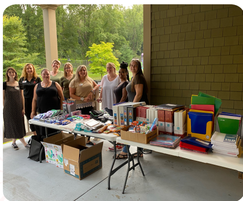
BACK TO SCHOOL EVENT WITH BRENTWOOD BANK