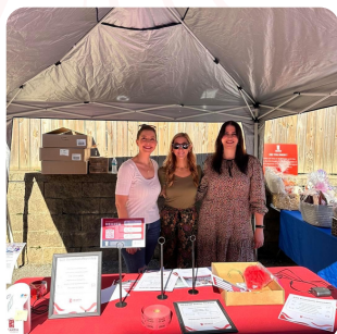
11TH HOUR EVENT