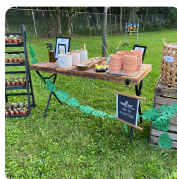
PLANT YOUR OWN POT EVENT