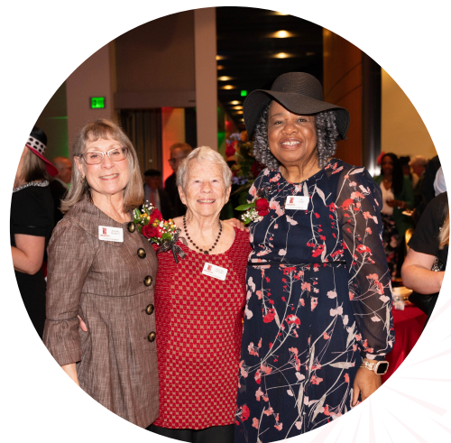
HEARTH FOUNDERS RECOGNIZED AT HATS OFF 2023