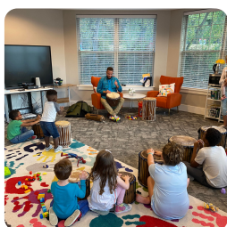
DRUMMING IN CHILDCARE