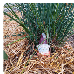
COMMUNITY GARDEN GNOME