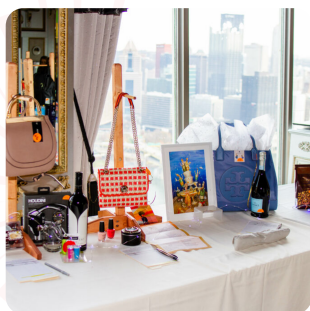
PURSES WITH A PURPOSE